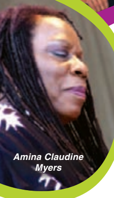
Amina Claudine Myers