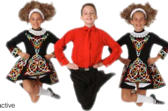
Trinity Irish Dancers

Enjoy a mix of live music and interactive dance performances. Each day will feature a different type of music — from swing and folk to hip-hop, bluegrass and pop — and all are sure to have you up on your feet dancing along.